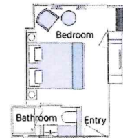
Emerald Stateroom 153ft 2 - 170ft 2