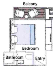
Emerald Panorama Balcony Suite 160ft 2 - 189ft 2