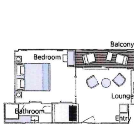
Owner's One-Bedroom Suite 285ft 2 - 315ft 2