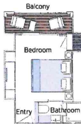
Grand Balcony Suite 207ft 2 - 210ft 2